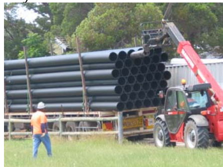
One of the 220 truckloads of pipe being unloaded. Around 4,250 pipes of different sizes will be transported into the area over the next few months!

Any Shareholders close to where excavation is taking place who require any clay/loam material delivered free to their property can contact Peter McBeath on 0419 048 580 to arrange delivery.